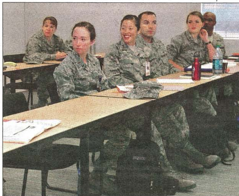
Air Force nurses (above) are in the first class at the trauma-training facility near Scottsdale Healthcare Osborn. The students practice on medical dummies (right) to prepare for the challenges of war-zone medicine.